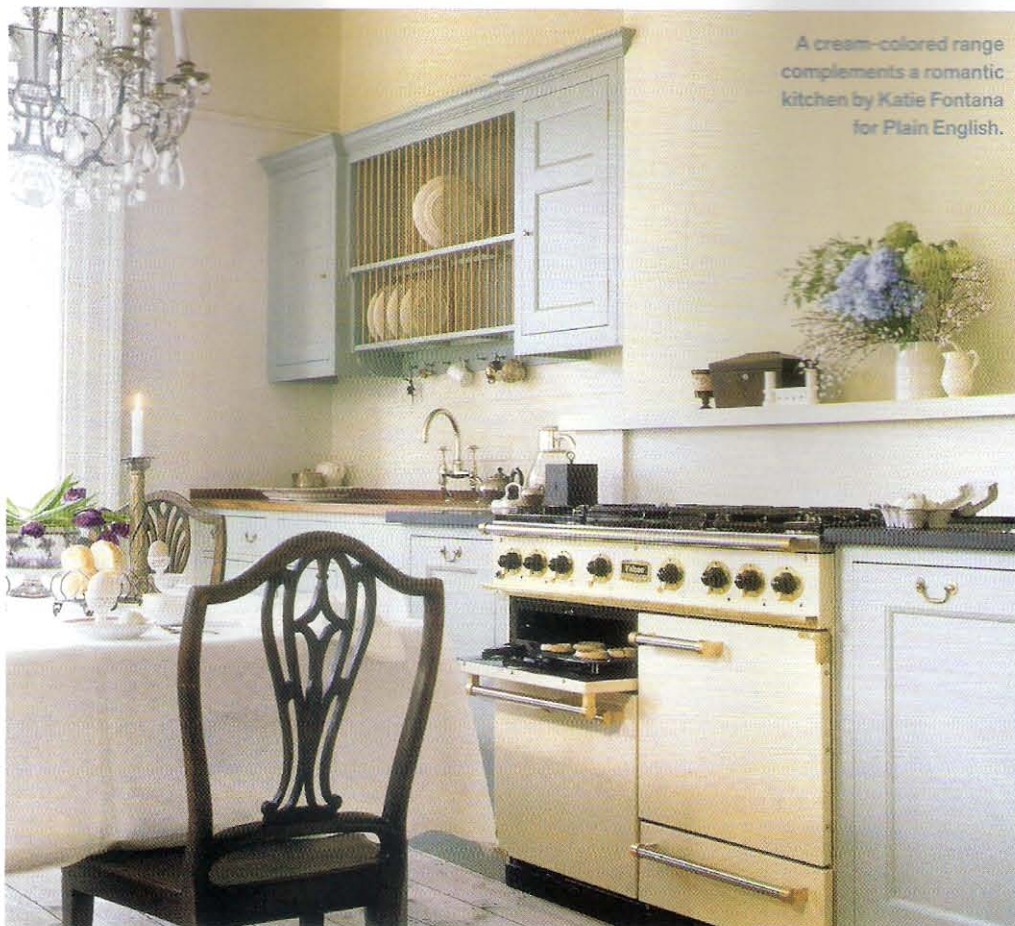
A cream-colored range complements a romantic kitchen by Katie Fontana for Plain English.