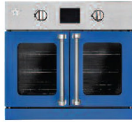
30" French Doors

Features a built-in artisan baking stone with precise temperature control, touch screen control panel with 12 cooking modes (including StoneBake™, True European Convection & Sabbath), Infrared Broiler, eco-friendly Continu Clean™ and an extra-large cavity that fits a commercial size baking sheet.