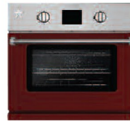
30" Drop Down Door