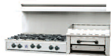
60" Heritage Classic