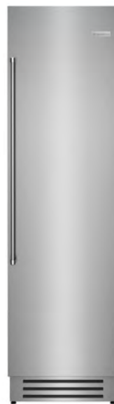
Model: BIFP24R0 with CP24RH1