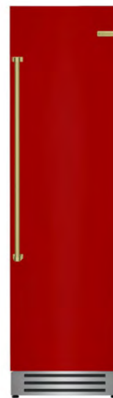
Model: BIFP24R0 with CP24RH1CPLT